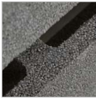
EPP-polypropylene has effective insulating properties