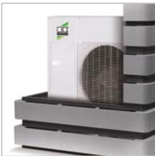
Noise reduction up to 15 dB(A)